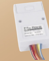
E18620 Serial Data Link Adapter

E18560 Frequency Converter ..... $95.00 A universal frequency converter is used to convert either speed signals or rpm pulses from a magnetic sensor to the pulses required by electronic speedometers, on-board computers, and similar equipment.