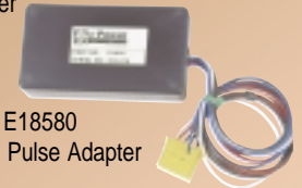
E18580 Speed Pulse Adapter