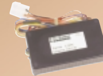
E18540 / E18560 Frequency Converter